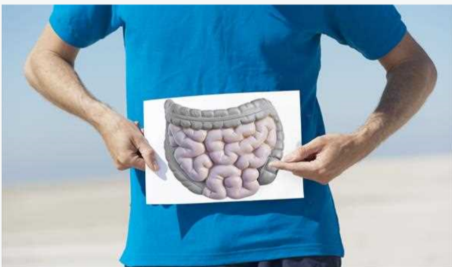
Nervous Stomach Nervous Stomach Symptoms Nervous Stomach